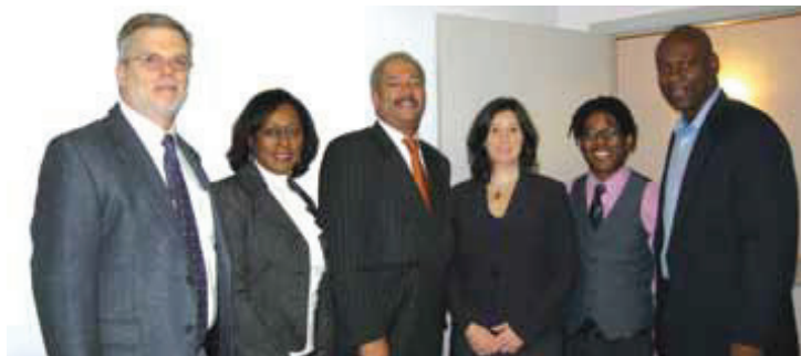
Co-op developers joined cooperative advocates from the Philadelphia area to meet with Rep. Chaka Fattah (D-Pa.), third from left, to discuss launching a federal program aimed at fostering urban cooperative development throughout the United States.

The National Cooperative Capital Investment Fund will address limited access to funding by serving as an alternative source of capital for cooperatives. While the Fund is projected to initially be capitalized modestly at $10 million, it will provide an opportunity for socially responsible investors, cooperative members and communities to invest in job creation and to grow the assets of member-owned businesses.